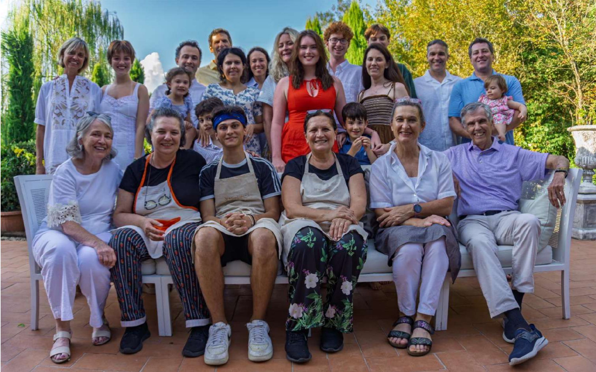
Happy Customers ★